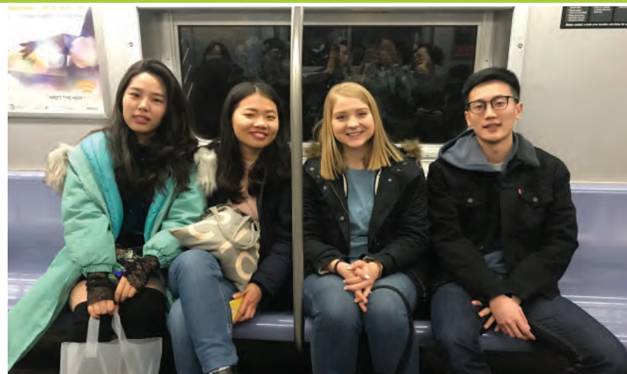
COLLEGIATE MINISTRY INTERN NW - CMI

APPLICATIONS DUE SEPT. 27, 2019 DISCOVERY DAY OCT. 5, 2019